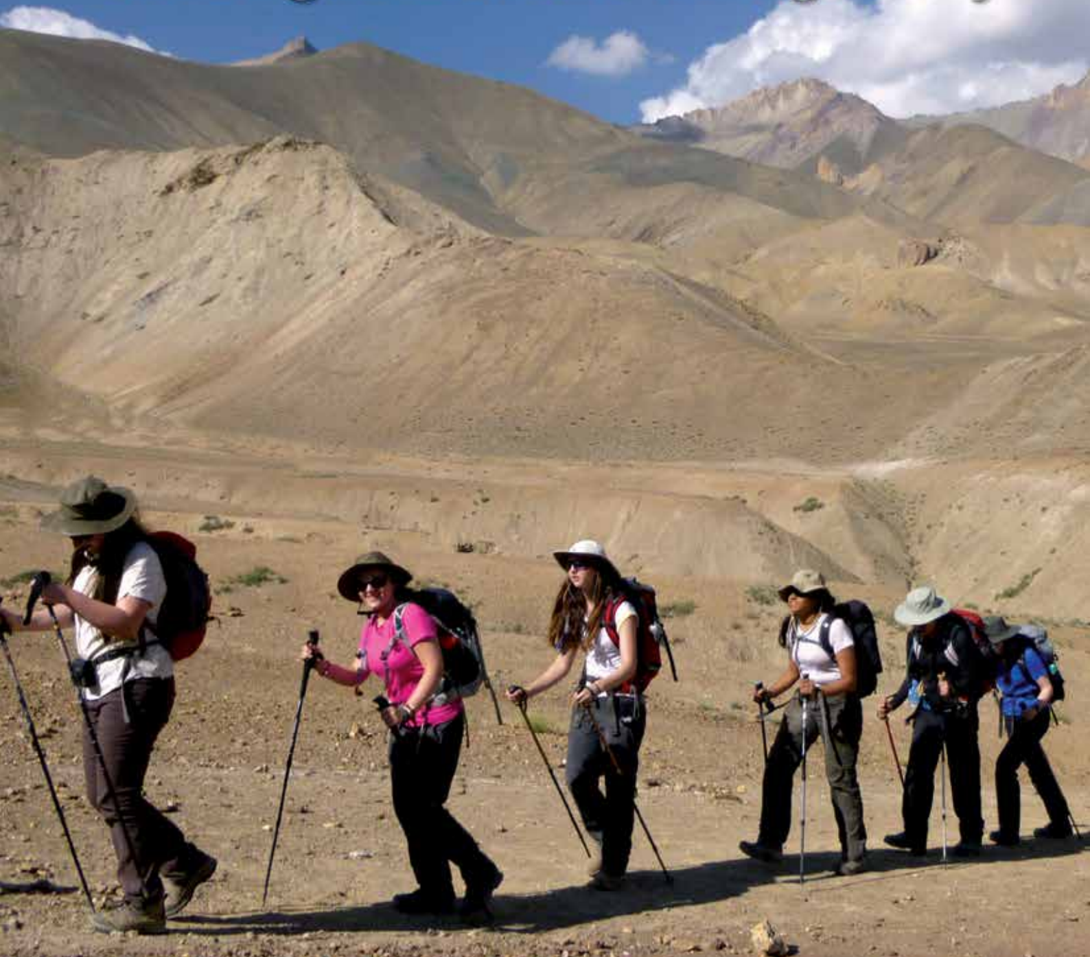
WGS 2013 World Challenge Team, trekking in the high Himalayan desert