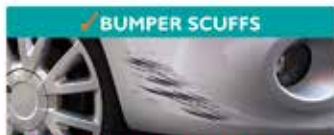
✓ BUMPER SCUFFS