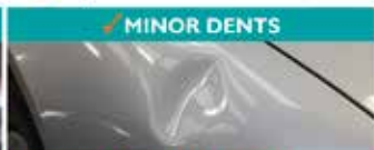
✓ MINOR DENTS