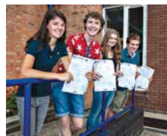
Students at Bridgewater High School celebrating their A Level results.

achievements and wish them every success for the future whether that is at university or in their chosen career pathways."