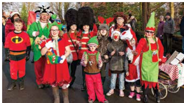
Lymm Youth Club in last year's Dickensian Parade.