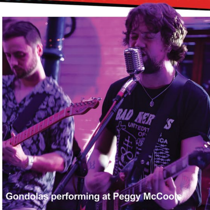
Gondolas performing at Peggy McCools

The music business is a truly global industry now, with our royalties being sent in American Dollars, Euros and even Japanese Yen! But you can't beat local music!