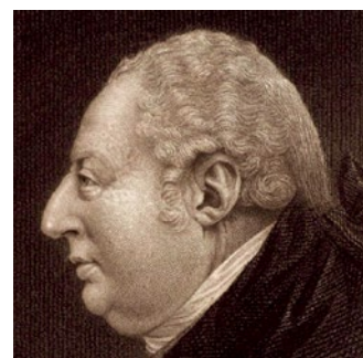
Francis Egerton 3rd Duke of Bridgewater

The 'Tvpresenter4history' History channel was launched in July in 2007 and has grown into a rich historical archive with over seven hundred video features and documentaries available to view for free highlighting ancient churches, buildings and historical sites across Cheshire and beyond. Many of the films are also featured on the National Churches Trust website. Why not take a look at my history channel where you can follow my latest history series 'Rambles through History' and my earlier series 'History Walks'.