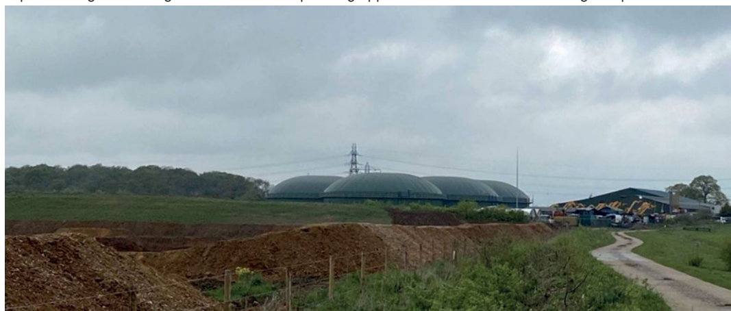
Comparable site just outside of London.

Officers will make a decision under delegated powers.