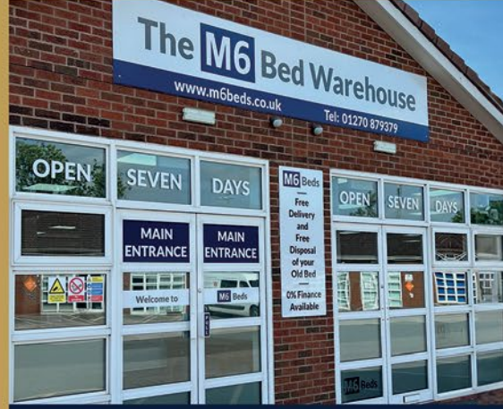
ALSAGER STORE RADWAY GREEN BUSINESS PARK - CW2 5PR