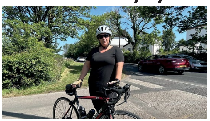
CHESHIRE Grange care home in Lymm provided a well-earned break for a group of care home staff taking on a gruelling 225-cycle challenge to raise money for charity.

The ride was from Dumfries to Cheshire and was to raise funds for the Barchester Charitable Foundation, which supports older people and other adults living with a disability or mental health problems by helping them to connect or re-connect with others in their local communities.