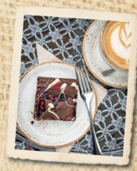
Visit our Primrose Cafe open 7 days a week