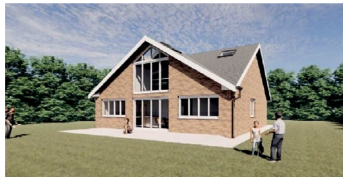
Impressions of the two dwellings proposed.