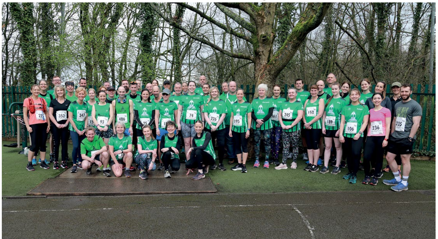
A massive turnout for Lymm Runners.