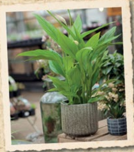
Indoor houseplants and gifts