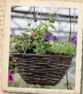
Bedding plants and hanging baskets