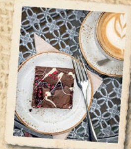
Visit our Primrose Cafe open 7 days a week