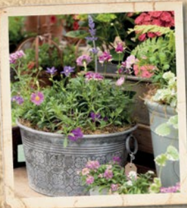
Wide range of plants, trees and shrubs

Come and visit our knowledgeable and friendly team at Primrose Hill Nurseries where we have an abundance of stunning plants and shrubs grown on site at Primrose.