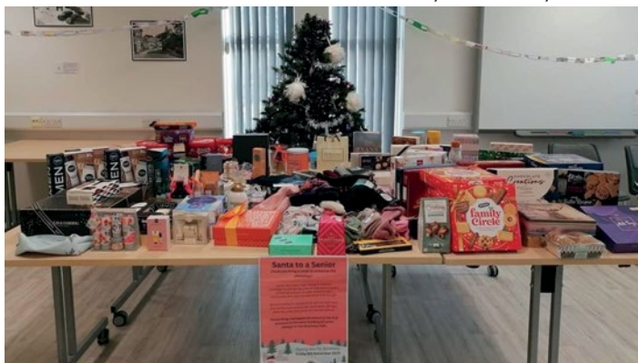
Christmas gifts donated by the Lymm community and the Hub Staff

Hub projects and services have now resumed, with regular groups including the Digital Café, Memory Café, Singing for the Brain and LymmPaC. If you're not yet familiar with the groups, events and services offered by the Hub (and further partners using the Lymm Library building), please get in touch or visit www.lymmshelterhub.co.uk