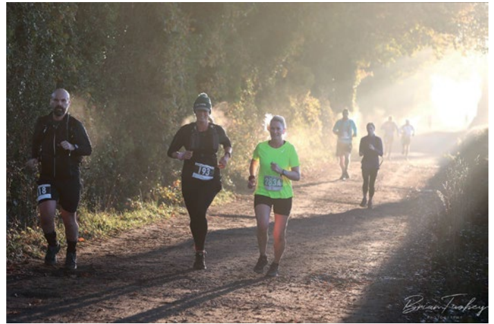
Early start.

The eleventh event is now being planned for November 2024, so if you, or any friends and family would like to know more, follow Warrington Way Facebook page or Instagram – or check out the Lymm Runners website at www.lymmrunners.org.uk