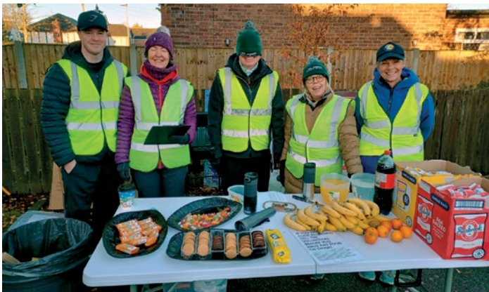
Volunteers ready at Checkpoint 1.