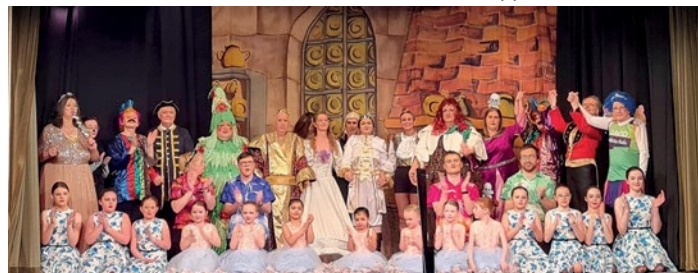
Last year's Cinderella cast.

bookings (subject to booking fees) or £8 on the door of a performance. It's best to book in advance though to avoid disappointment.