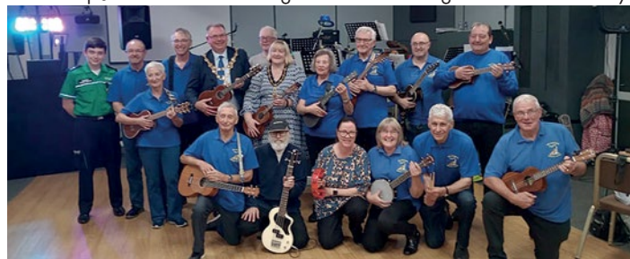
Members of the Rockets