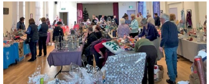
A busy event at Croft Village Memorial Hall.