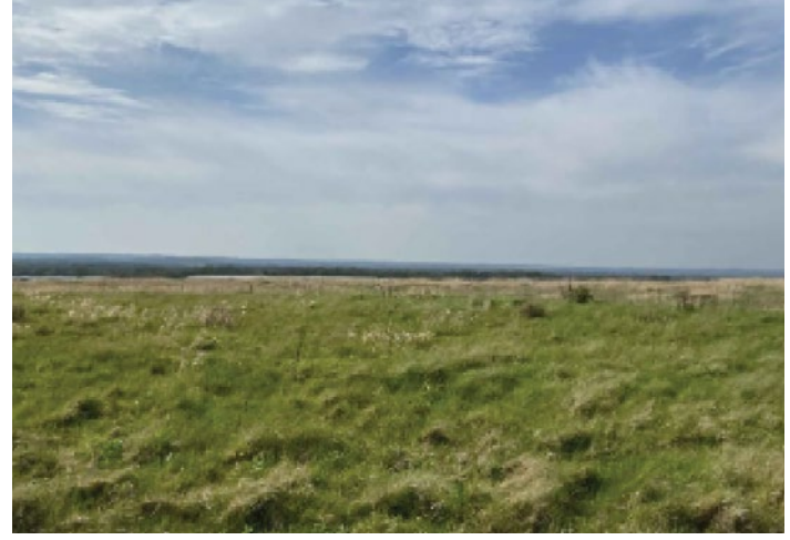
Silver lane with travellers and the solar farm site as it is now

Call our Team: 01925 251143 sales@aspire-computers.com