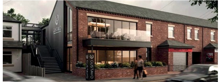
How the new restaurant would look

NEW plans have been submitted to transform the former China Rose Chinese restaurant in Culcheth into a high-end hospitality venue after a previous application was rejected by planners.