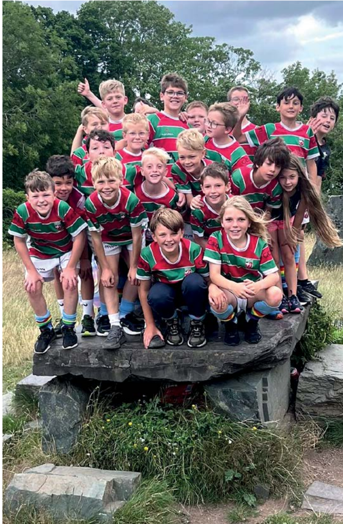
BUDDING young rugby players from Warrington RUFC Under 10s enjoyed their first rugby tour experience.

The U10 team, which is sponsored by local property partner, X-Press Legal Services, enjoyed a two-night tour of north Wales, enjoying their sport alongside some outdoor pursuits.