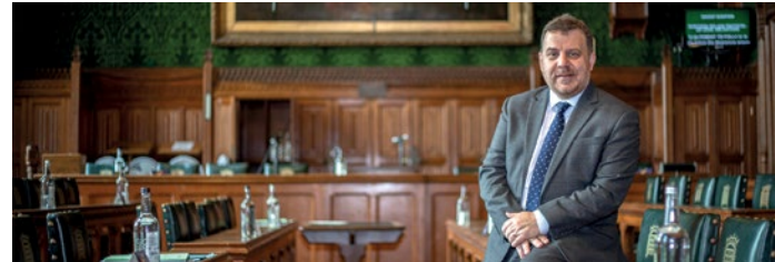
Andy Carter MP