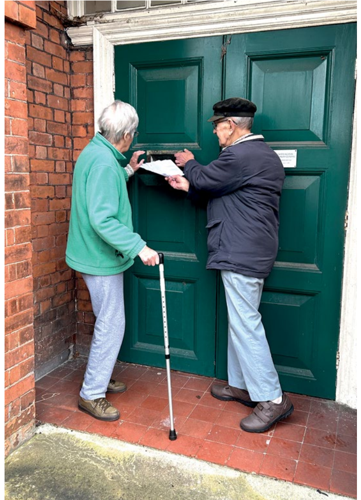
Luncheon Club members drop off new membership application.