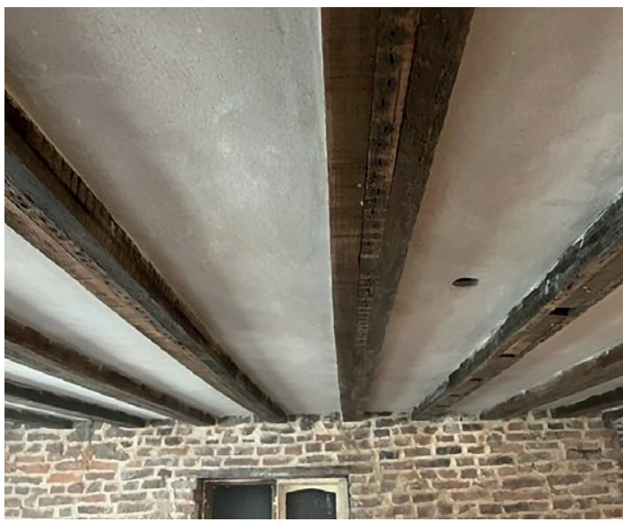
THE painstaking work to restore and recreate the historic Raven Inn at Glazebury, saved from demolition by local campaigners, can now be revealed.

Earmarked for demolition until successful campaign to save the pub, work is continuing to re-open the premises, hopefully in time for Easter!