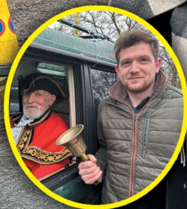
Town Crier made Honorary Freeman of Lymm