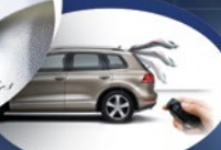
Electric Hatch Opener