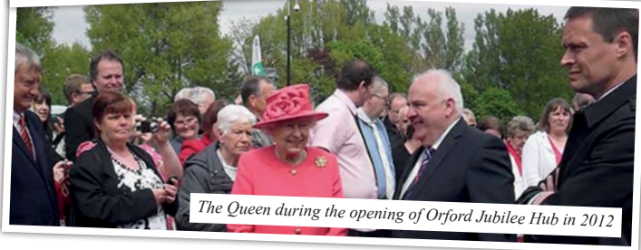
The Queen during the opening of Orford Jubilee Hub in 2012