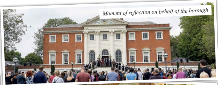
Moment of reflection on behalf of the borough