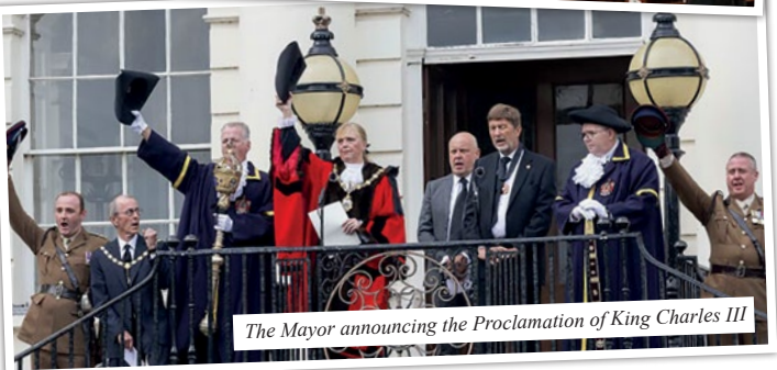
The Mayor announcing the Proclamation of King Charles III

SAVE £s AND FIT IT YOURSELF FINANCE AVAILABLE