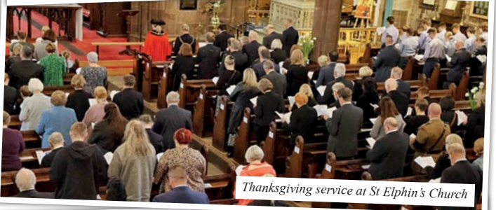
Thanksgiving service at St Elphin's Church