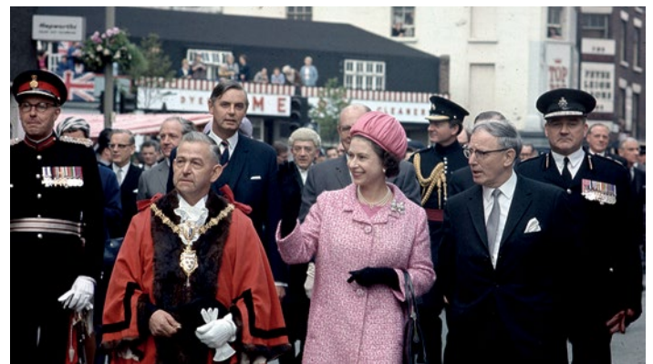
The Queen during her first visit to Warrington in 1968.