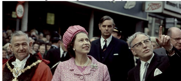
The Queen pictured in Bridge Street in 1968.

Deadline for the November issue of Lymm Life is October 11