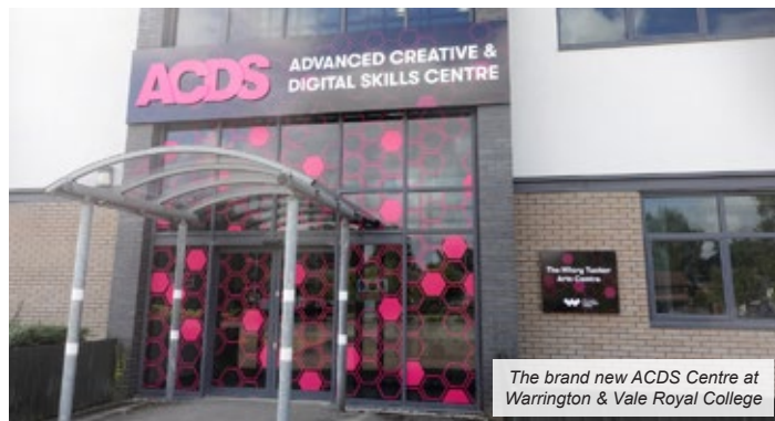
The brand new ACDS Centre at Warrington & Vale Royal College

Visit: wvr.ac.uk to view the entire range of courses on offer and start your journey to success today.