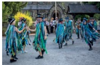
More pictures online at www.lymm.life.co.uk

Following the traditional walk with rushes through the village, a special service took place at St Mary's church.