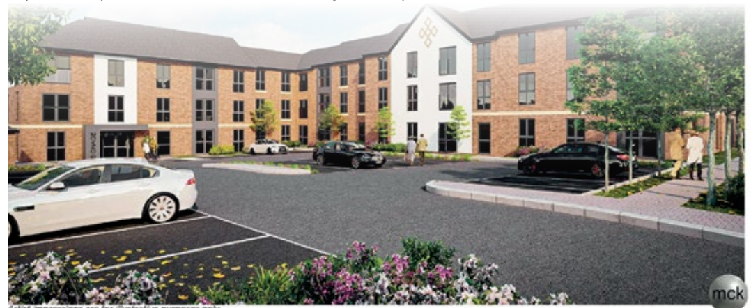
Artist impressions are for illustrative purposes only.

The planning application has now been submitted to the borough council and is being considered by planning officers.