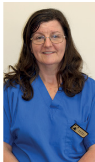
a vets and experience of working with farm animals and horses is also vital.

A: All vet schools have slightly different entrance requirements and competition for places is fierce. Generally you will need A grades at GCSE and A level in sciences and maths. Work experience at