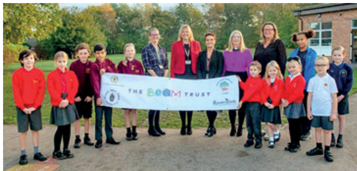
THE Beam Trust, involving four primary schools at Lymm, is celebrating its 1st birthday in May and making plans for next year after a successful first year.