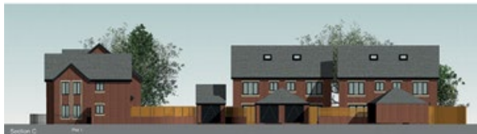
An artists impression of the proposed houses.