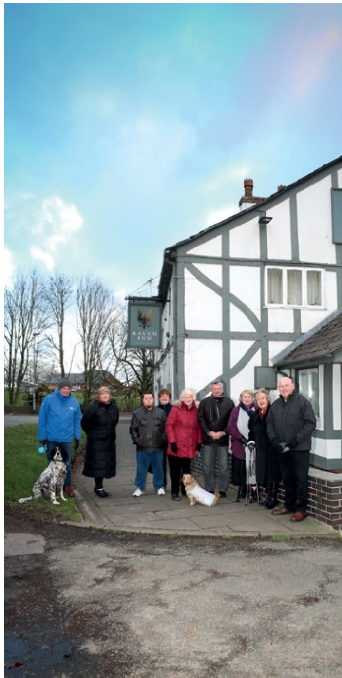
Campaigners pictured at The Raven Inn pre-pandemic.