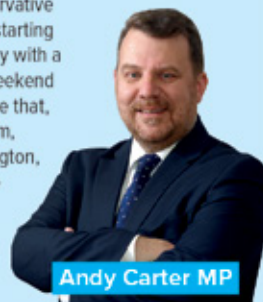
Andy Carter MP

And by supporting Conservative Councillors who are kickstarting local high streets recovery with a campaign to offer free weekend parking we can make sure that, when shops open in Lymm, Stockton Heath or Warrington, shoppers right across the Borough will be able to once again 'shop local' and rebuild our economy!