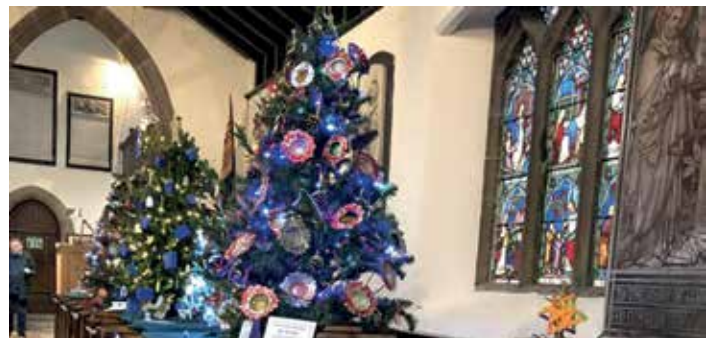
Picture shows a previous Christmas Tree Festival.

THE COVID-19 pandemic has hit finances at Lymm's St Mary's Church – leaving the church about £10,000 down on its usual income.