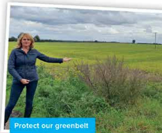
Protect our greenbelt

5 Youth provision. This has been underfunded for many years, several of the youth groups in the area are finding it difficult to continue. As your Councillors, we will continue to work with and support community groups in a joined-up way with the Council, to provide much needed activities and safe places for young people to meet and socialise.