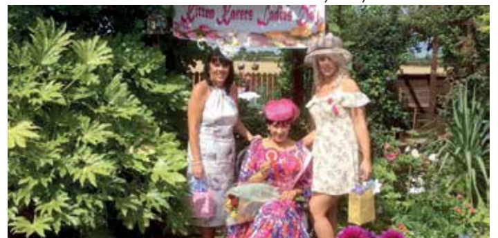
Last year's event.

It would have been the fifth ladies day this year