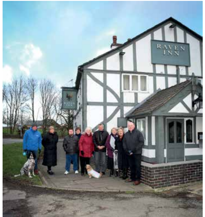
Campaigners pictured before lockdown.

"We remain a positive option for the owners and a pretty good moral option. We have made two offers for the Raven, the second above current market value. We have been open to meaningful discussion right from the start of this process."