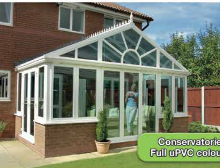
Conservatories & Orangeries Full uPVC colour range available