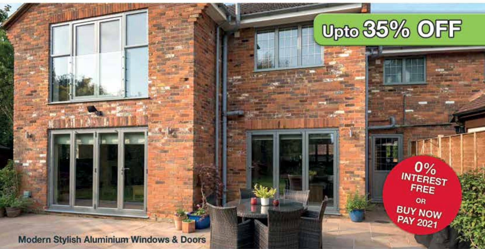
Modern Stylish Aluminium Windows & Doors