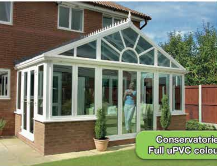
Conservatories & Orangeries Full uPVC colour range available