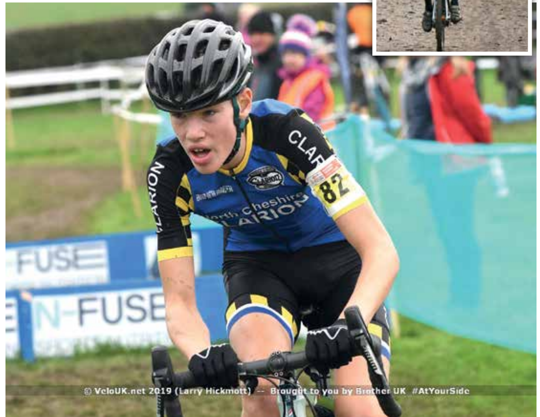
Brought to you by Brother UK #AtYourSide