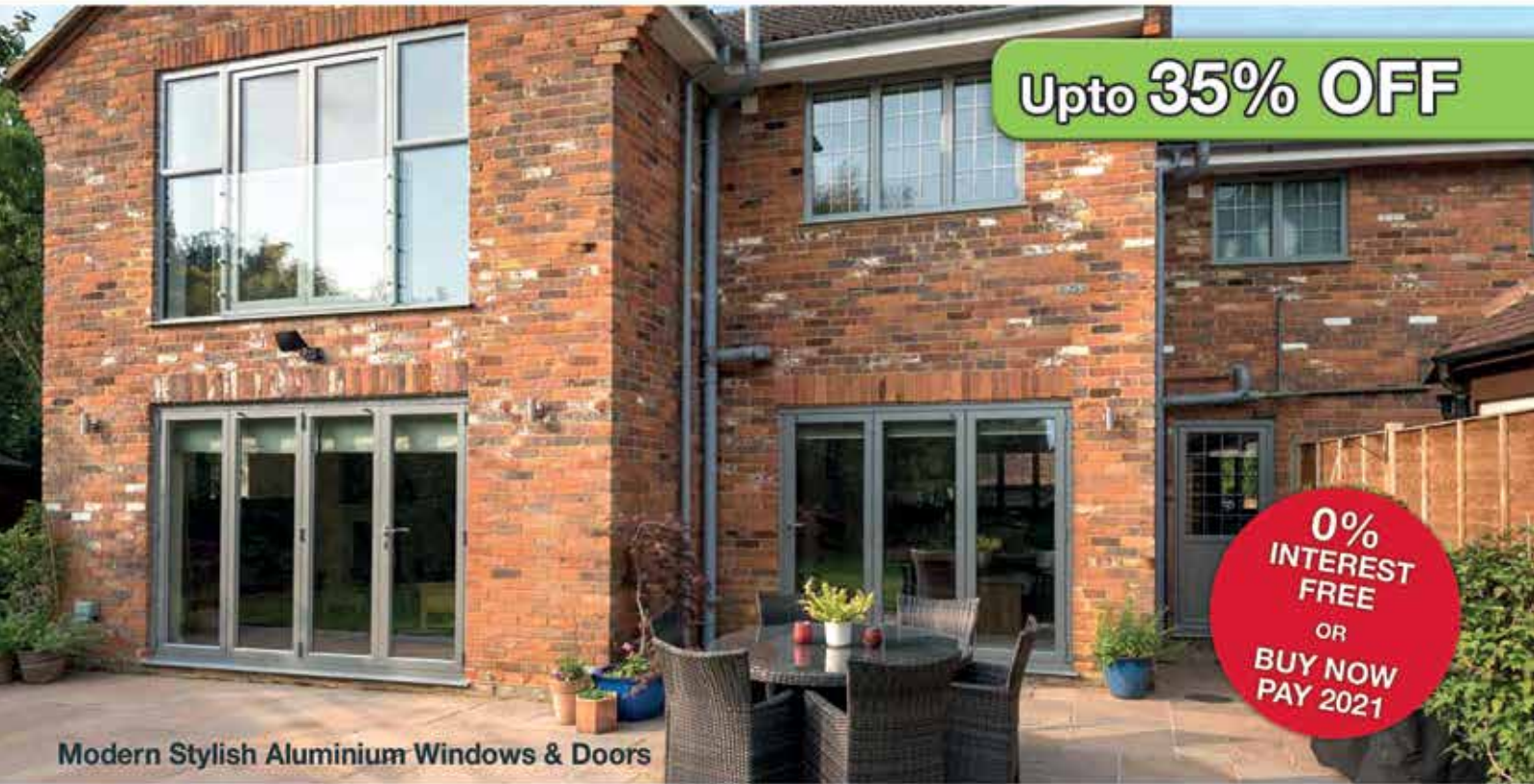
Modern Stylish Aluminium Windows & Doors