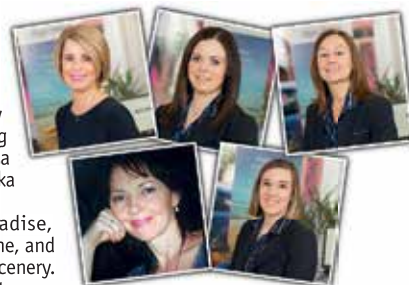
■ Stockton Heath Hays Travel Team.

Greece offers a host of magical destinations to create unforgettable holiday experiences that all visitors are bound to enjoy.