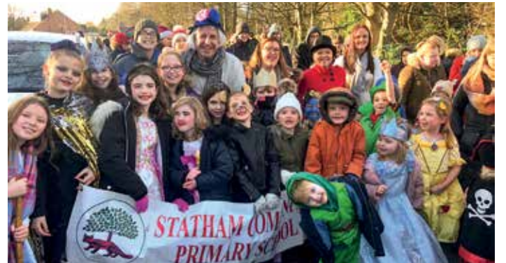
Statham Primary youngsters.

Check out www.warrington-worldwide.co.uk for more pictures and video