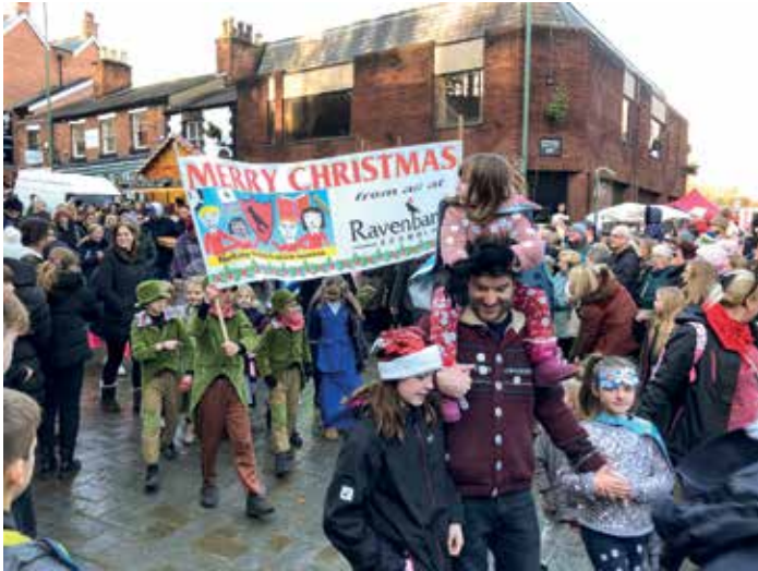
Ravenbank Primary in the parade.