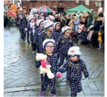
Lymm Adivas parade.