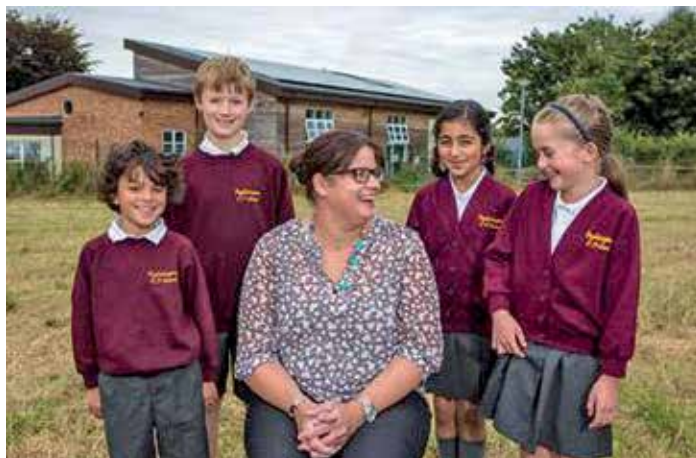
LCE's first solar PV installation at Oughtrington Community Primary School in September 2015

For more details visit www.lowcarbonlymm.org.uk or email LCE at info@lowcarbonlymm.org.uk