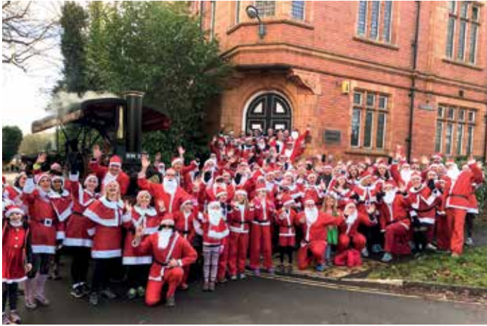
Lymm Runners all dressed as Santa.