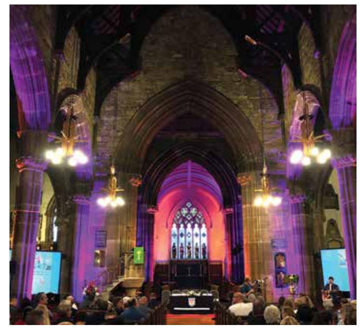
St Elphin's Church provided a memorable venue for the annual awards.

Others secured places at university, apprenticeships or employment, and