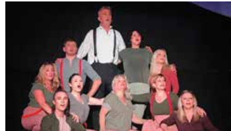
The Lymm Panto troupe rehearse yodelling.

IN what is billed as a night of 'Lederhosen and Lager', the Lymm Panto troupe is busy rehearsing for their version of Mary Shelley's horror story 'Frankenstein'.