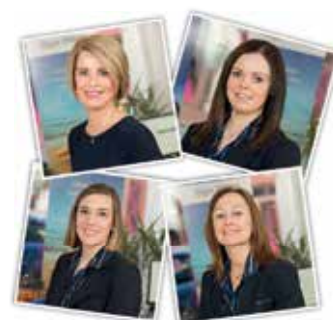
Stockton Heath Hays Travel Team.

Hold a small and intimate ceremony with the Beachcomber Bliss package from £545, or enjoy additional extras such as bouquet, hair and make-up for the bride with the Beachcomber Barefoot wedding package from £770. Or create a unique and personalised wedding with the Beachcomber Bespoke package from £1315. Our team can also arrange a variety of extra little touches to make