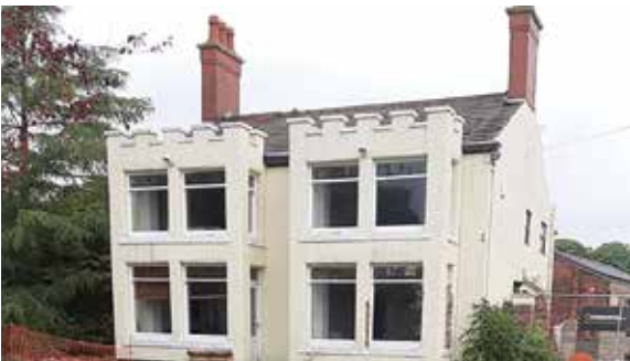
The farmhouse before it was delmoished.

PLANNING chiefs have put off a decision on proposals to demolish and replace an old farm house at Croft – even though the property has already been demolished.