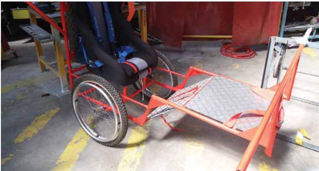
The bespoke chariot.

To make a donation visit www.justgiving.com/teams/CheshireFire .