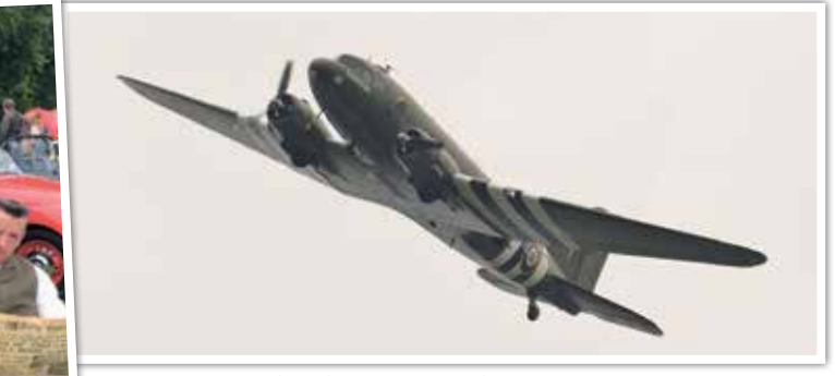
The Dakota C-47.