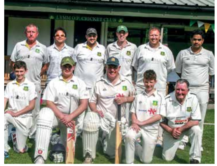
Lymm Oughtrington Park 2nd XI

two games won, three drawn, four lost and two abandoned were less comfortably placed just 13 points clear of the relegation zone.