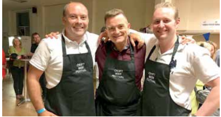
The second Croft Beer Festival at Croft Village Memorial Hall (14th & 15th June) will feature a range of drinks from across the globe, along with entertainment from the North West and food made in Croft village itself.

Some 29 casks of ale, both brewed and sourced from across the UK by Warrington based brewer '4Ts', are the centrepiece of the event, well supported by several Ciders, a fridge full of Lagers from across the world, a wide variety of Gins and cases upon cases of Prosecco. As if there wasn't enough variety organisers have added in a variety, organisers have added in a small Rum bar too!