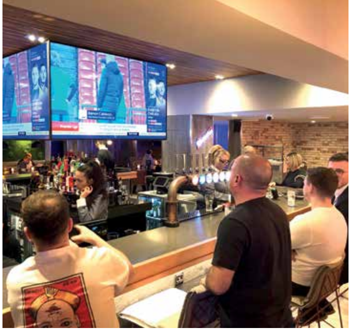
The Village Hotel has undergone a major refurbishment with the opening of the brand new Pub & Grill, taking recent investment to over \mbox{\mbox{$\pounds$}} 1m.

investment to over £1m. The new facility provides all day dining facilities alongside big screen TVs for sports fans, alongside a plush dining area for those who prefer a more intimate dining experience. As well as the traditional big screens at the bar, there is also a mini cinema with 10 theatre seats and a 99 inch screen, to help with the big match experience. Centre piece is a brand new bar serving a variety of drinks to suit all tastes, while the dining area also