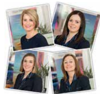
■ Stockton Heath Hays Travel Team.

We crammed so much into our weeks holiday, visiting Souks, Forts, Markets, deep canyons, sinkholes and hot springs to swim. Two highlights for us were the Ras Al Jinz turtle reserve, where we were able to watch sea turtles nesting in their natural environment. At 1000 Nights Camp, we slept in traditional-styled black goat hair tents.