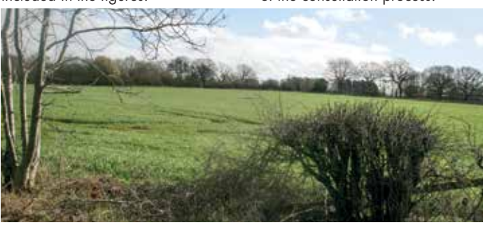
Sixty homes planned off Massey Brook Lane.

If the draft local plan is approved by the borough council on March 25, an eight week public consultation will take place, starting in April, with the council planning to write to every household as part of the consultation process.