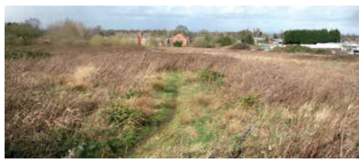
The Tanyard Farm site would accomodate 200 homes.