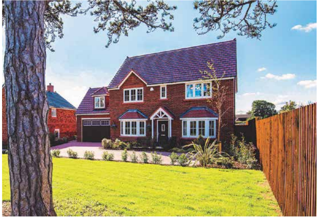
A typical Elan homes, similar to those at Culcheth Green

UPGRADE your living arrangements with a move to a brand new Elan home at Culcheth Green, where upgrades are included as standard.