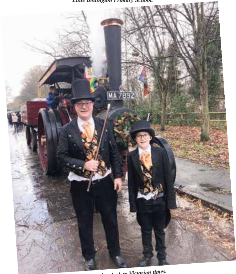
Turning back the clock to Victorian times.