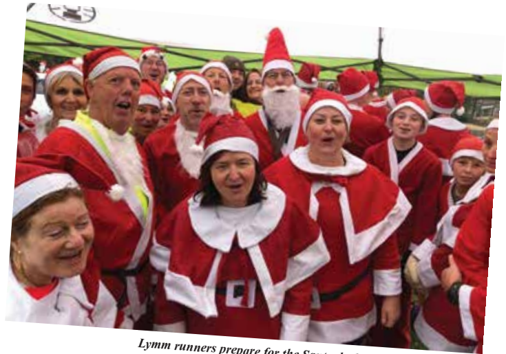
Lymm runners prepare for the Santa dash.