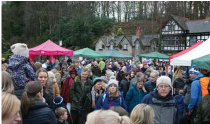
Crowds pack into the village.