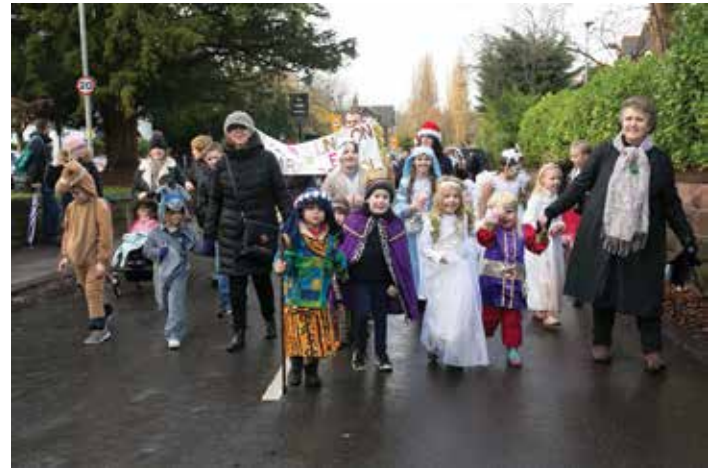
Little Bollington Primary School.