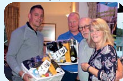
1st Prize Roofing Consultants Group