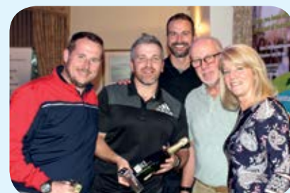
3rd Prize Creative Hut