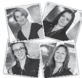
■ Stockton Heath Hays Travel Team.

brochures to assist in finding the right river cruise which can be extended pre and post cruise.