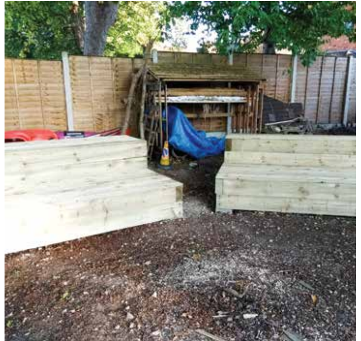
The Hurrell Huddle

The space will be used by the group's Beavers, Rainbows, Cubs, Brownies, Scouts and Guides who list campfire cooking and roasting marshmallows amongst the highlights of their packed activity