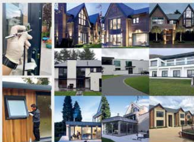
Large and small projects undertaken