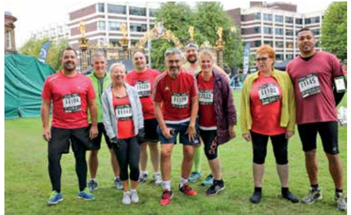
The Worldwide team.

Donations can still be made online here https://uk.virginmoneygiving.com/Team/WarringtonWorldwide