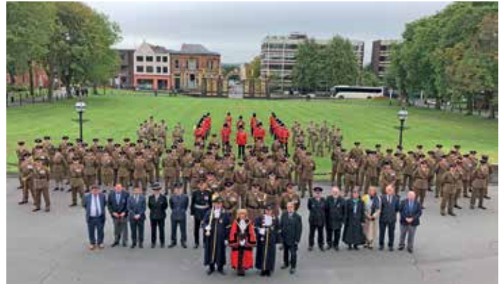
The 75 Engineers Regiment.

The Freedom was first granted to the South Lancashire Regiment in 1947 and passed to the Duke of Lancaster's Regiment in 2006.