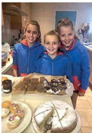
Guides providing refreshments