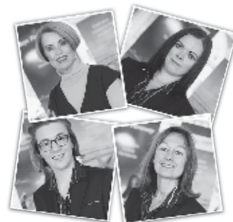
■ Stockton Heath Hays Travel Team.